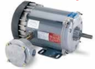
56/140 Frame Explosion Proof Class I Groups C & D, Class II Groups F & G