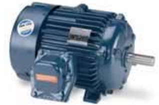
Blue Chip® Severe Duty Single Label