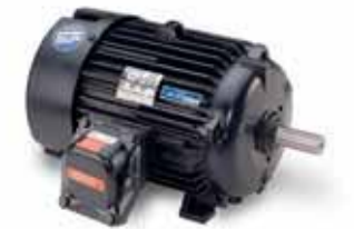
Blue Chip XRI® Premium Severe Duty Dual Label